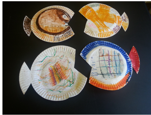
Craft created by the children to illustrate the Lesson that Jesus Helps Catch Fish

The Grace Church Children’s Sunday School is held at 10:30 a.m. every Sunday except the fourth Sunday, when the children join their families for the service in church. The program is geared for boys and girls from 4- to 14-years-old. After the bible lesson of the day is read and discussed, the children have a craft activity that relates to the lesson.