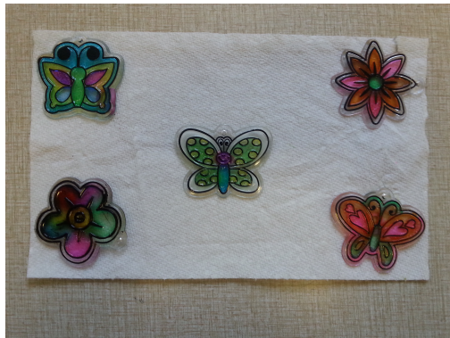
Lesson - Jesus Is Alive: The children created beautiful flower and butterfly sun catcher paintings to represent new life for the season of Easter.

They also created place mats and paintings to illustrate these lessons.